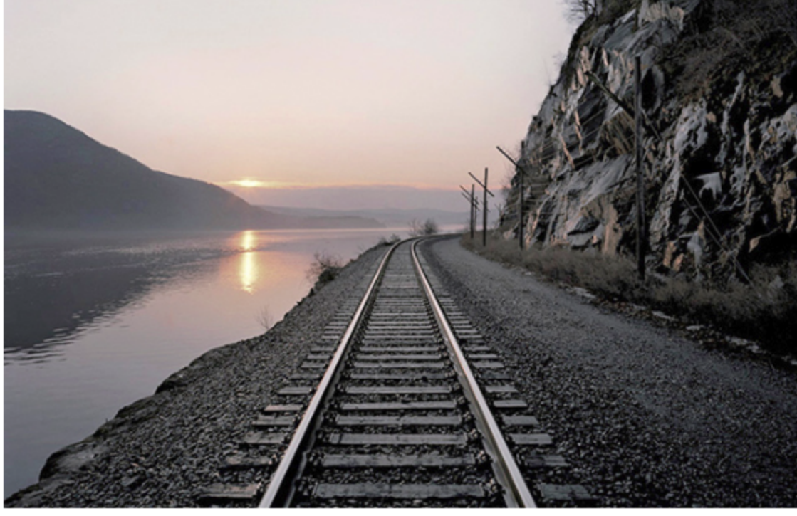
"Storm King, New York" from the Railroad Landscapes Series

Photographers Benjamin Fredrickson and Scot Sothem present concurrent solo shows. Where Fredrickson reveals a collection of polaroid images chronicling his time as a sex worker, Sothem showcases, Lowlife 1985 - 1981, a series of black and white shots of Los Angeles-based sex workers in the 1980s.