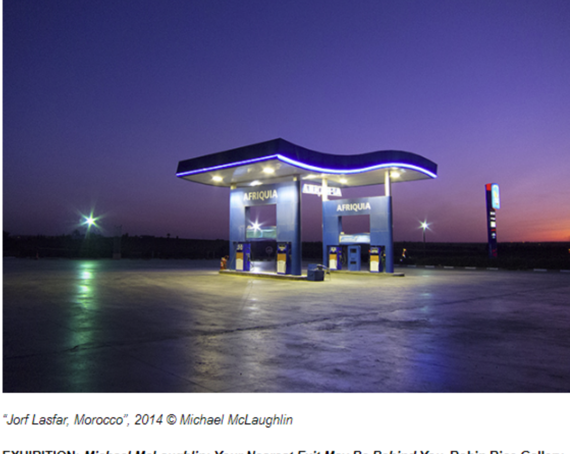
"Jorf Lasfar, Morocco", 2014