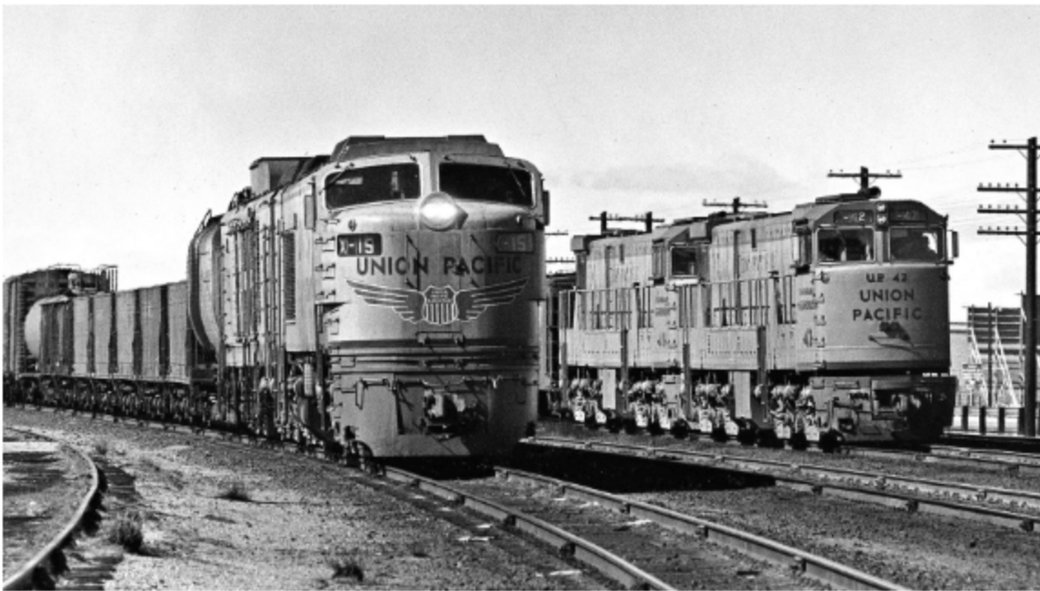
Two Union Pacific eastbound freight trains, led by "big blow" turbine X-15 and U50 no. 42, wait to enter the yard in Cheyenne, Wyoming, on April 3, 1965.

Mark your calendars now for Conversations 2017, April 28-30 at Lake Forest College.