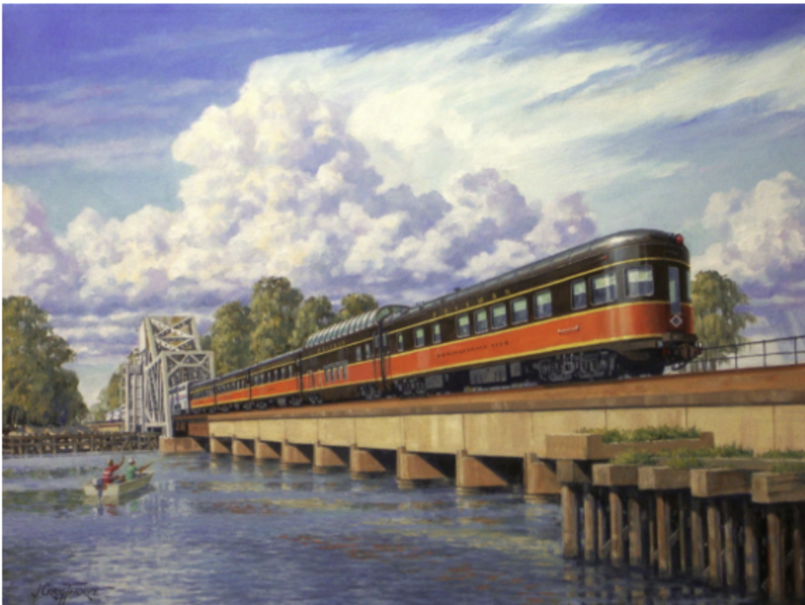
Oil on canvas painting showing the Pullman Rail Journeys addition to Amtrak's City of New Orleans by 2016 presenter J. Craig Thorpe