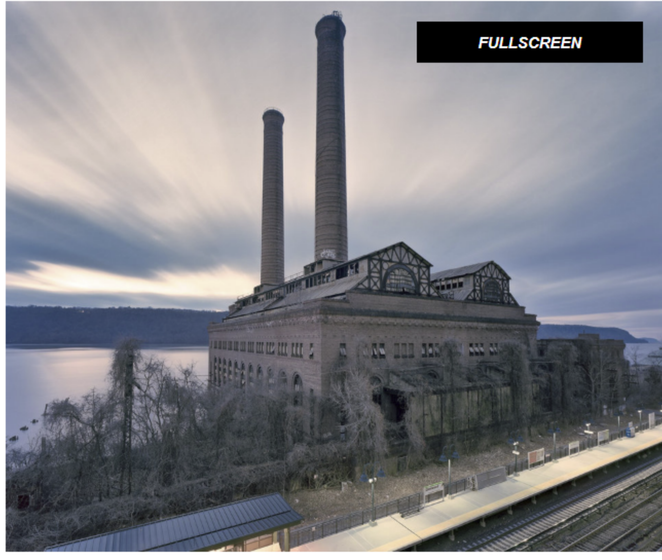
Railroad Power Station, Glenwood, NY

BY JEN CARLSON IN ARTS & ENTERTAINMENT ON AUG 29, 2014 2:25 PM